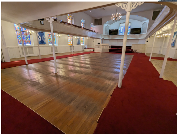
The sanctuary in December 2023, shortly before work began.