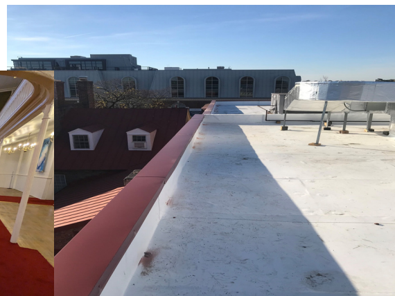
A portion of the new TCG roof, including some of the roof ducting repairs and insulation.